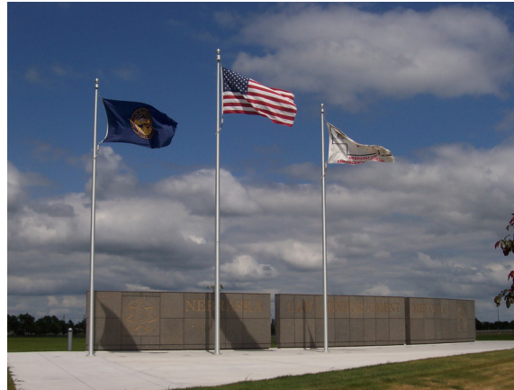
Nebraska Law Enforcement Memorial Fonner Park, Grand Island, Nebraska

Name: _____ Address: _____ _____ City: _____ State: _____ Zip: _____ Email: _____ Employed by: _____ Rank: _____ Please enclose $10.00 Beneficiary: _____ Beneficiary's Address: _____